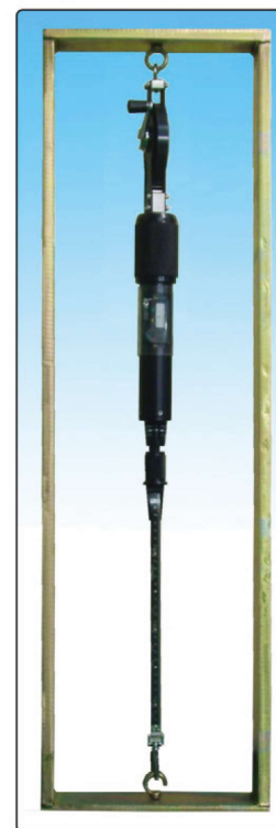
[Model 2350DF calibration frame]