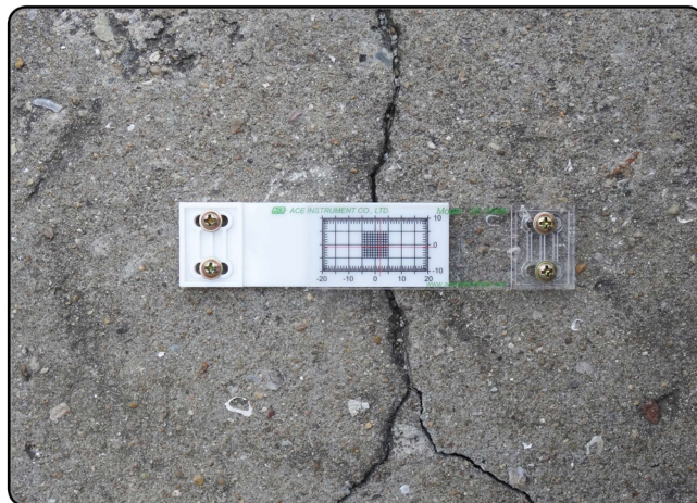
[SC-100A install on the surface]

Depend on installation environment and measurement range, select and use.