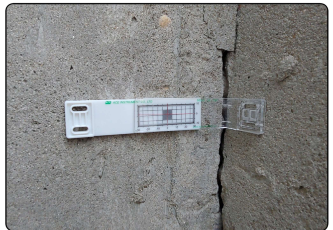
[SC-100C install on the corner]